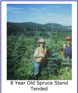
8 Year Old Spruce Stand Tended

The success of reforestation is monitored by surveying the blocks after planting in accordance with the Alberta Regeneration Survey Manual. Surveys include the Establishment Survey which is completed between 4-8 years after harvest and the Performance Survey which must be completed between 8-14 years after harvest. The survey results must be reported to the Alberta Government.