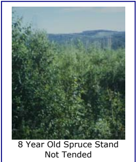
8 Year Old Spruce Stand Not Tended

Post harvest treatments are often required to aid in successful reforestation. This is very important in sites with high amounts of competing vegetation or wet sites. The tending enables the seedlings to survive the competition or wet conditions. Canfor uses mechanical site preparation (e.g. mounding, ripping and mulching), mechanical thinning/weeding (e.g. brushsawing), aerial herbicide and ground based herbicide (e.g. backpack) to treat blocks and aid in prompt effective reforestation.