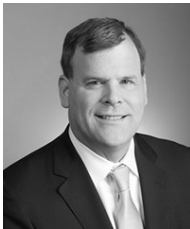
Honourable John R. Baird Toronto, Ontario Canada