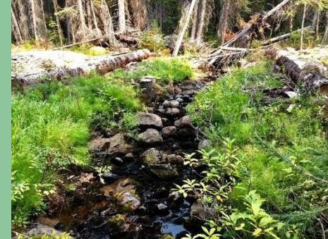
Inspection of a recent bridge deactivation project at the Company's Fort St. James operation found that the operation had done a good job of protecting the stream channel during the deactivation of the crossing.