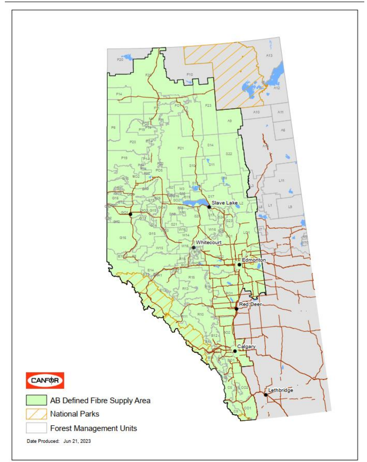
Figure 2: Alberta Defined Fibre Supply Area