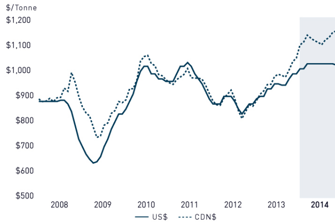
NBSK PULP LIST PRICE DELIVERED TO U.S. - IN US AND CANADIAN DOLLARS

Note: Canadian price is calculated as the US price multiplied by the average monthly exchange rate per the Bank of Canada Source: Resource Information Systems Inc.