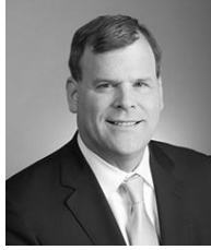
Honourable John R. Baird Toronto, Ontario Canada