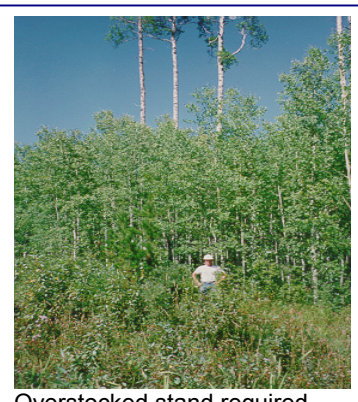
Overstocked stand required stand tending.