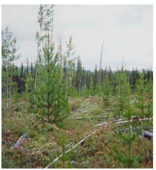
Healthy forest of young pine trees recently stand tended (thinned to provide optimum growing space).