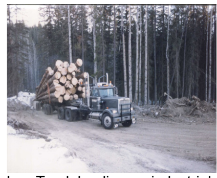
Log Truck hauling on industrial road system.

Both Grande Prairie and Hines creek utilize Government and Industrial road systems to bring in the required volume to the respective mills.