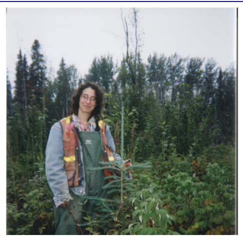
Superior seedling performance – Planted in 1997, photo taken 2000.