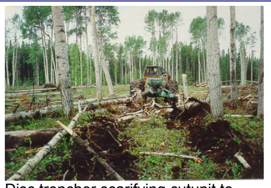
Disc trencher scarifying cutunit to prepare planting spots.