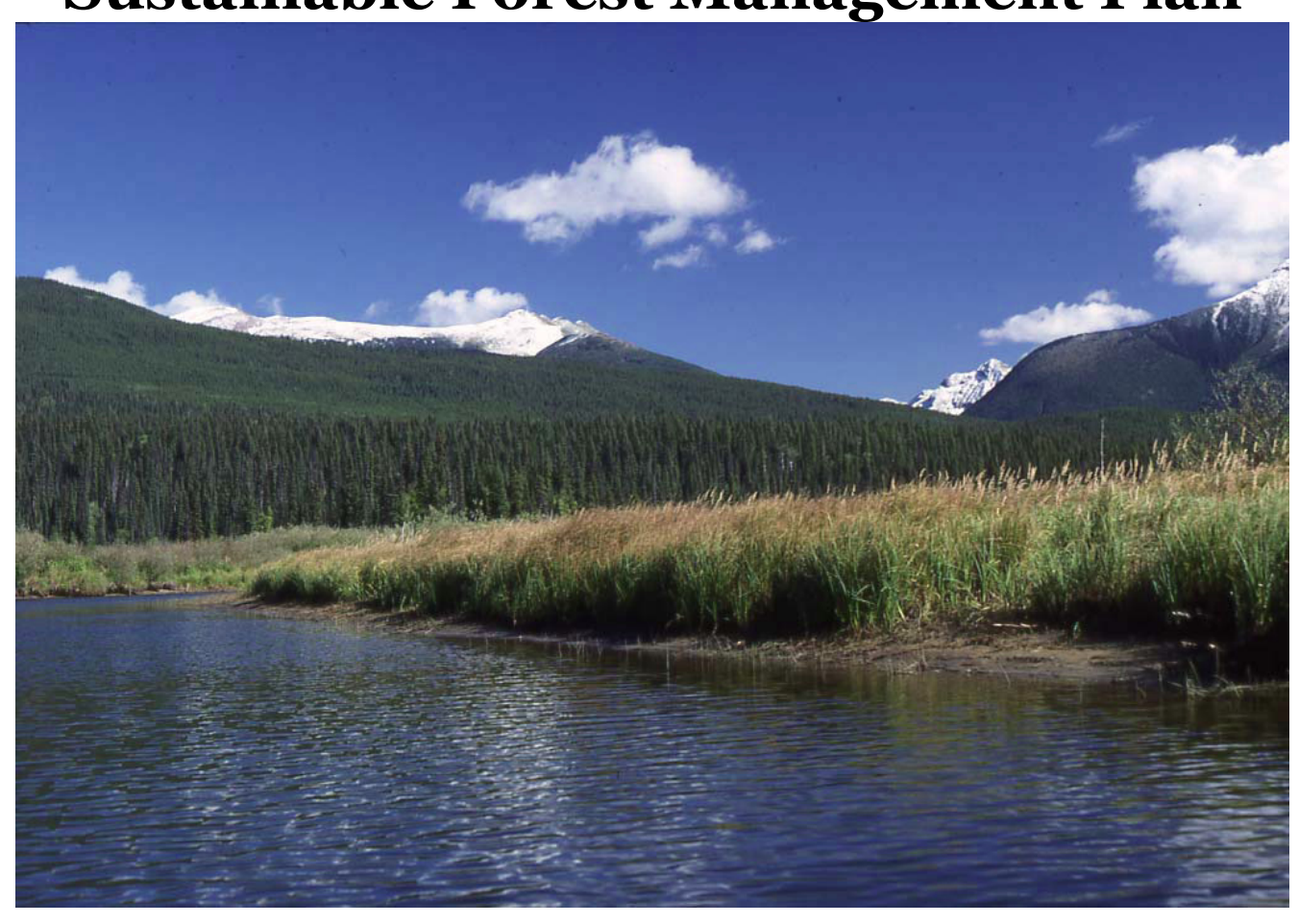
2012/13 Annual Report